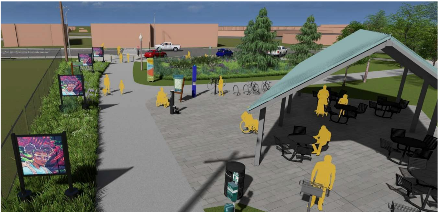
Example of public art along Hodiamont Greenway in Gwen Giles Park (not actual art panel size or shape)

The goal of the artwork will be to deepen understanding, broaden perspectives, and inspire engagement with the world around us. The art should convey interpretive themes of the site which include the following and/or the community-identified priorities for the Hodiamont Greenway listed on page 1 of this Request for Qualifications: