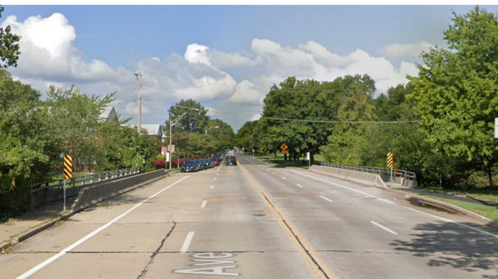
EXISTING CONDITIONS Looking West from Vernon Ave. & River Des Peres bridge crossing

PROPOSED DESIGN: LOOKING WEST FROM VERNON AVE. & RIVER DES PERES BRIDGE CROSSING