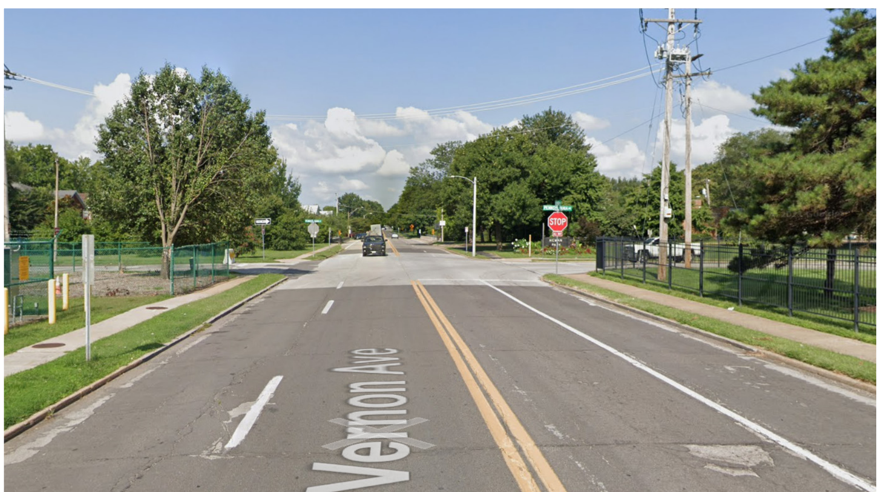
EXISTING CONDITIONS Looking West from Pennsylvania Ave. & Vernon Ave.

PROPOSED DESIGN: LOOKING WEST FROM PENNSYLVANIA AVE. & VERNON AVE.