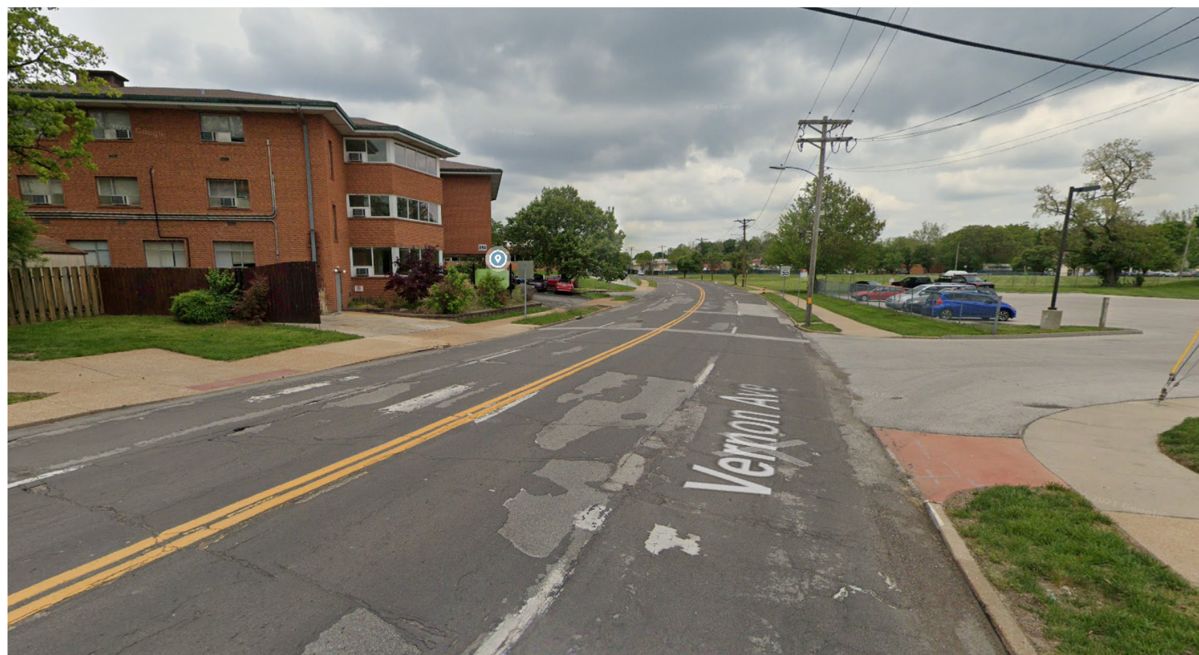
EXISTING CONDITIONS Looking west from Vernon Ave. & Westgate Ave.

PROPOSED DESIGN: LOOKING WEST FROM VERNON AVE. & WESTGATE AVE.