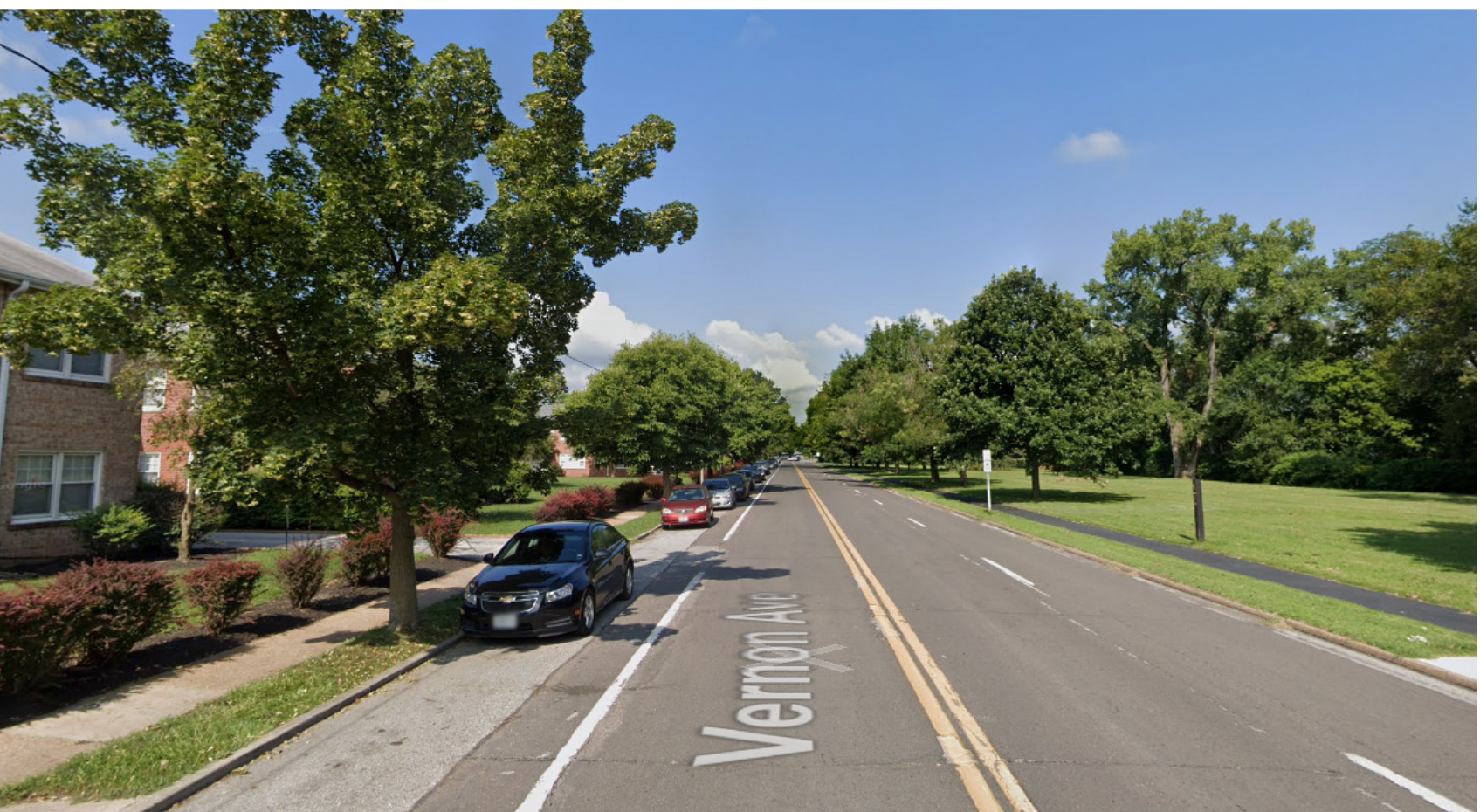
EXISTING CONDITIONS Looking West along Vernon Ave. at Huntley Ridge Apartments (left)

PROPOSED DESIGN: LOOKING WEST ALONG VERNON AVE. WITH HUNTLEY RIDGE APARTMENTS (LEFT)