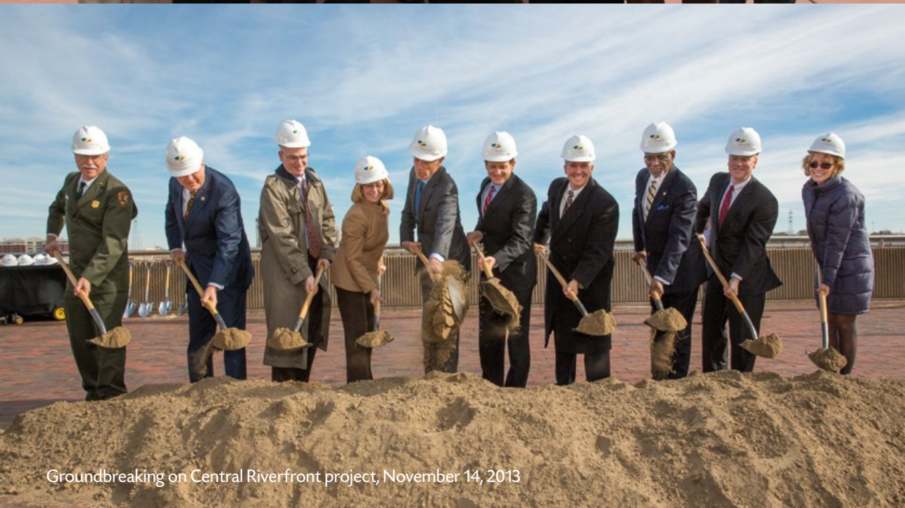
Groundbreaking on Central Riverfront project, November 14, 2013

Thanks to the voters, Prop P has effectively doubled the District's income—enabling us to accelerate our work in more than 17 active greenways, build more on and off -road trails, and expand the river ring.