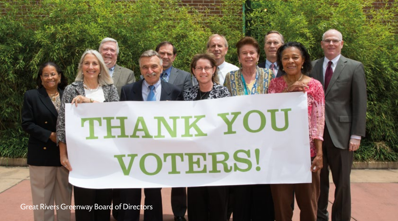
Great Rivers Greenway Board of Directors