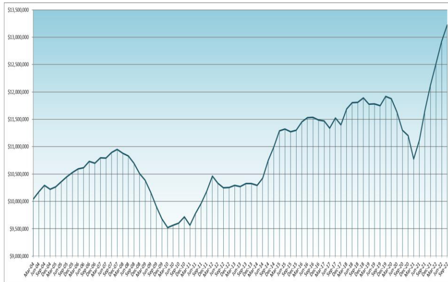
Schedule of Trailing 12 Month Ending 1/10th Sales Tax Revenue (Cash Basis)