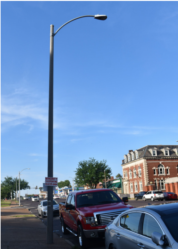
BRICKLINE GREENWAY NORTH CONNECTOR ART BANNERS

Four artists will be selected to develop designs for banners along Grand Avenue from Natural Bridge to Cass. The double-sided banners are 30" wide by 72" tall. Two banners are installed side-by-side on each pole. Each selected artist will develop four related designs, which should be variations on a theme. The four designs will be printed and installed, alternatingly, on twelve streetlights, throughout a 2 – 3 block section of the corridor. The Brickline Greenway branding and the artist's name will be incorporated into the bottom of each banner.