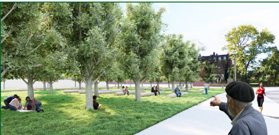
NATURAL AREAS like gardens or orchards

displayed in murals, art, signage, or a community stars walk of fame