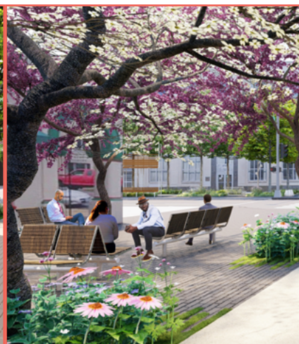
RESPITE AREAS to enhance nearby destinations