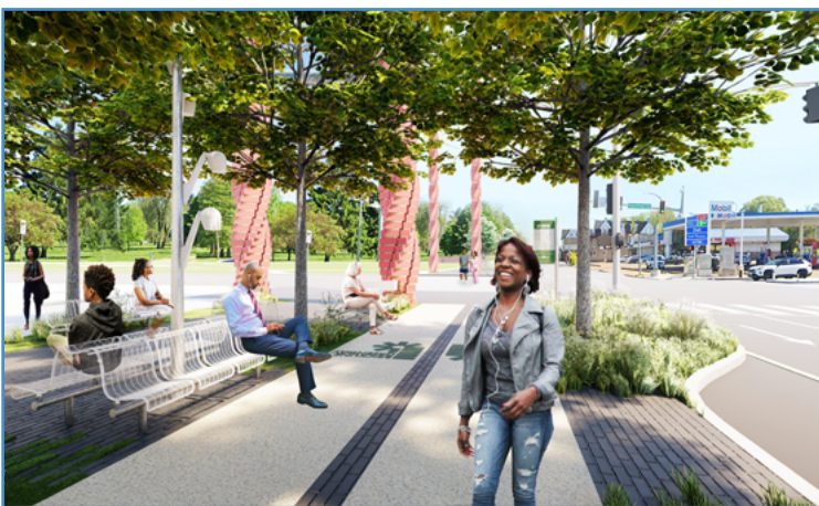
GATEWAY MARKERS at major areas, like Fairground Park

These conceptual ideas are not final, they'll help guide the design as it moves along: