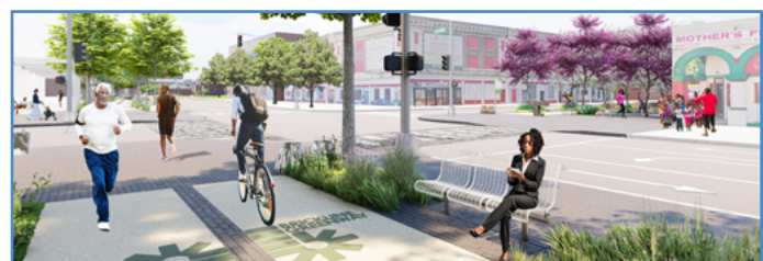
AMENITIES: like lights and benches