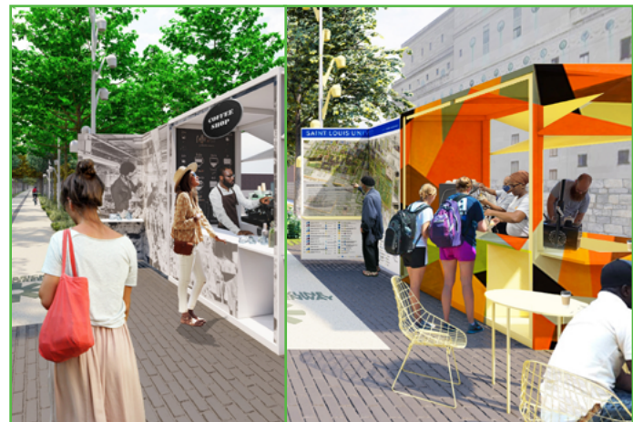
KIOSKS of small businesses, vendors, community organizations and resources