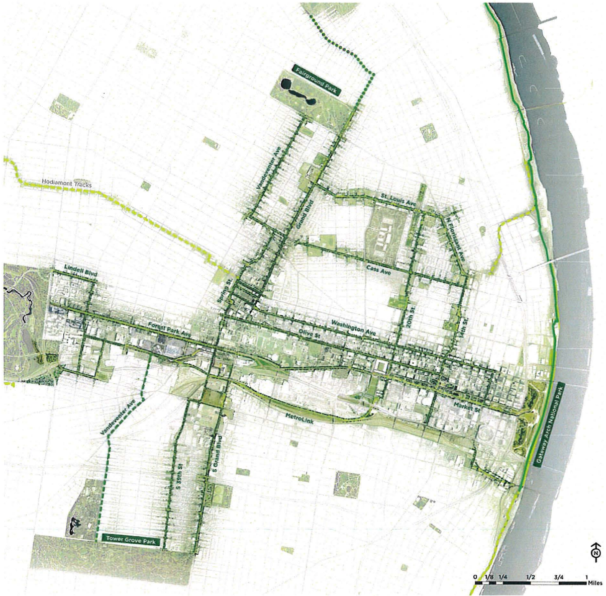
EXHIBIT A: POTENTIAL LOCATION OF BRICKLINE GREENWAY