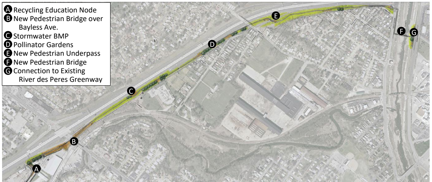
Gravois Greenway Phase 2 Expansion to River des Peres Greenway

Visit www.GreatRiversGreenway.org or call 314-436-7009