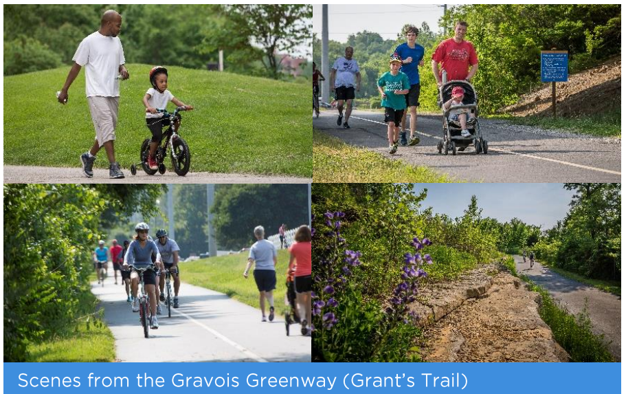
Scenes from the Gravois Greenway (Grant's Trail)

Like all Great Rivers Greenway projects, we seek input from area residents. The project team held public open houses in 2012, 2013 and 2017 and meetings with nearby property owners in 2016 and 2018. The team also met with representatives from the Missouri Department of Transportation (MoDOT), Ameren, the Metropolitan St. Louis Sewer District, and nearby business owners. This greenway connection will follow an existing railroad corridor and MoDOT right of way. The greenway will not be built on any private residential property. This route differs from the 2013 proposed route because it proved to have the greatest achievability for safely connecting the Gravois and River des Peres Greenways in the near future.