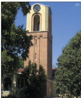
Lindell Pavillion in Forest Park