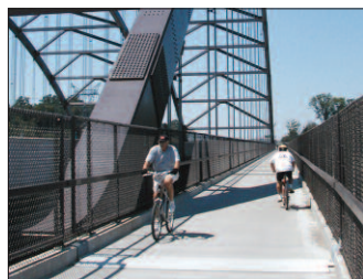
Veterans Memorial Bridge