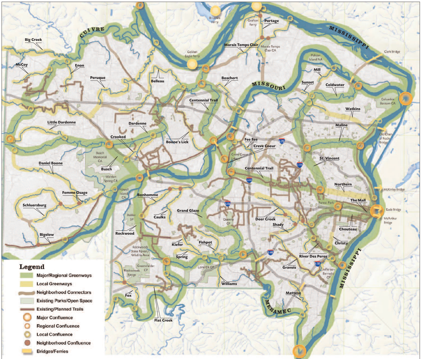
THE INTERCONNECTED SYSTEM OF GREENWAYS, PARKS AND TRAILS