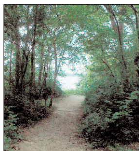
Sunset Park at Missouri River