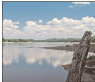
Missouri River Greenway

Description: Development of a 1.5-mile trail along the Howard Bend levee. The trail will extend along the levee from Veterans Memorial Bridge to the north. Ultimately, the trail will parallel the Missouri River for 34 miles. This project will include a new picnic area near Creve Coeur Airport.