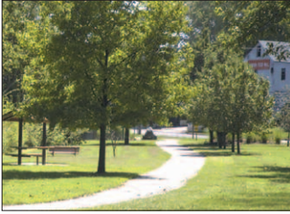
Meramec Greenway Trail