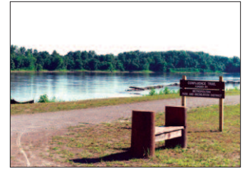
Confluence Trail – Columbia Bottom Conservation Area

Description: Funding for a five-mile hiking and biking trail in the Columbia Bottom Conservation Area completed in spring 2003. Great Rivers Greenway also acquired 280 acres adjacent to the Columbia Bottom Conservation Area for future expansion.