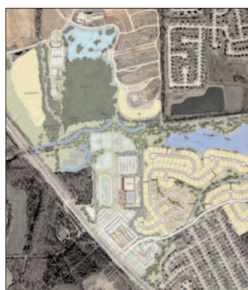
Dardenne Greenway at BaratHaven