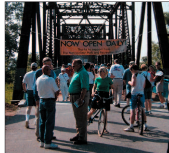
Old Chain of Rocks Bridge