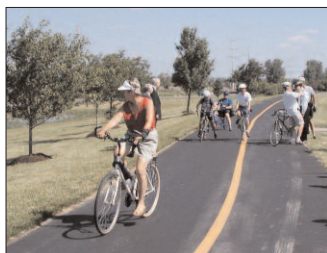
Creve Coeur County Park

Description: The Missouri River Greenway (Phase I) will parallel the Missouri River from the confluence with the Mississippi River at the Columbia Bottom Conservation Area to the Veterans Memorial Bridge in Maryland Heights. Several SEED projects have been selected for preliminary design in 2004, pending approval by the public sector land owners involved in each project. Construction of the projects will begin after approvals are received and the design is completed.