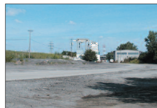
Mary Meachum Freedom Crossing

Partner(s): Grace Hill Neighborhood Services; National Park Service; Whitaker Foundation; and Missouri Department of Natural Resources, State Historic Preservation Office