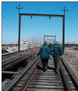
McKinley Bridge and Branch Street Railroad Trestle

Description: Funding to create bicycle and pedestrian access across the McKinley Bridge to connect existing and proposed bicycle and greenway projects in Missouri and Illinois. In 2003, Great Rivers Greenway commissioned a feasibility study to determine appropriate bicycle and pedestrian connections.