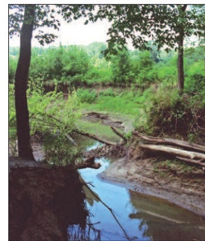
St. Stanislaus Conservation Area

Description: Great Rivers Greenway is working with the City of Hazelwood to develop a trail through Truman Park that will connect the city of Hazelwood to St. Stanislaus Conservation Area. The project includes a bridge over Aubuchon Creek.