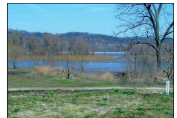
Portage Des Sioux Nature Area

Description: Great Rivers Greenway is working with the City of Portage Des Sioux to construct a 40-acre nature area in eastern St. Charles County. The nature area will allow for passive recreational activities and feature restored wildlife habitats. The nature area will open in early 2004.