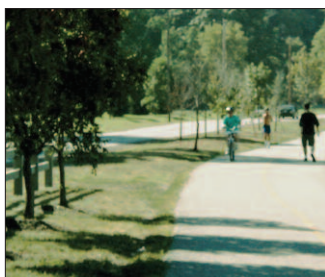
Creve Coeur County Park

Description: Great Rivers Greenway provided funds to plan and design a bicycle and pedestrian trail from the Katy Trail to existing bicycle facilities within the City of St. Peters. The new trail will link the bicycle facility on the Veterans Memorial Bridge and provide connections to Creve Coeur County Park in St. Louis County.