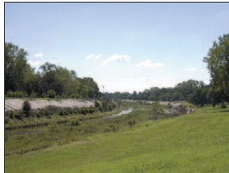
River Des Peres

Description: Great Rivers Greenway provided funding to plan, design and construct approximately 4 miles of greenway and trails within the Christy Greenway. The greenway will connect the River Des Peres Greenway to existing bicycle paths in south St. Louis City.