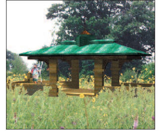
Canary Island Riverside Greenway

Description: Planning, design and site development for a greenway along the River Des Peres and the Mississippi River in Lemay, with a connection to Jefferson Barracks County Park.