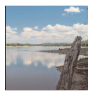
Missouri River Greenway

to the Veterans Memorial Bridge in Maryland Heights. Several SEED projects have been selected for preliminary design in 2004, pending approval by the public sector land owners involved in each project. Construction of the projects will begin after approvals are received and the design is completed.