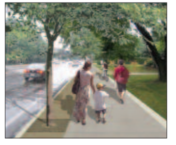
Olive Blvd and I-170

along Dardenne Creek in St. Charles County. The project will provide public trail connections to residential, commercial and institutional areas within the proposed BaratHaven development and its surroundings. The project includes the construction of trails, recre-