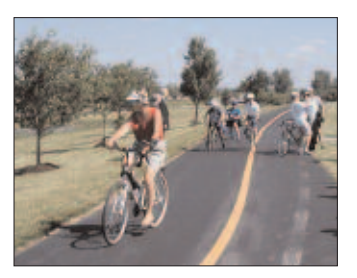
Creve Coeur County Park

Description: The Missouri River Greenway (Phase I) will parallel the Missouri River from the confluence with the Mississippi River at the Columbia Bottom Conservation Area