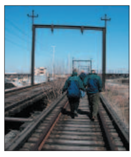
McKinley Bridge and Branch Street Railroad Trestle

Description: Funding to create bicycle and pedestrian access across the McKinley Bridge to connect existing and proposed bicycle and greenway projects in Missouri and Illinois. Project is under construction and is targeted to be complete in 2007.