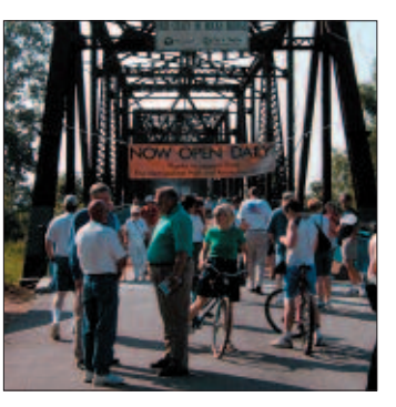
Old Chain of Rocks Bridge